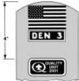
CUB SCOUT OR WEBELOS SCOUT RIGHT SLEEVE