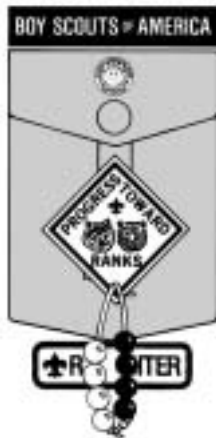
CUB SCOUT RIGHT POCKET

Conduct uniform inspections with common sense; the basic rule is neatness.