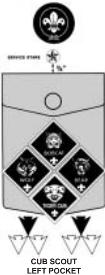
CUB SCOUT LEFT POCKET