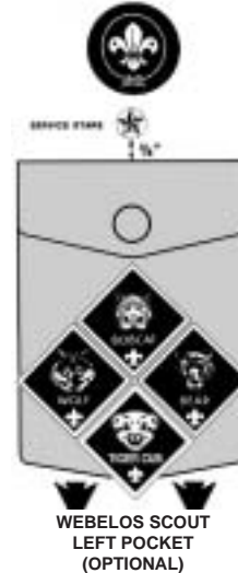
WEBELOS SCOUT LEFT POCKET (OPTIONAL)