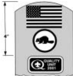
WEBELOS SCOUT RIGHT SLEEVE